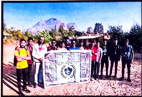
At the base of the Fort

“Break free from plastic, for a healthier planet.”