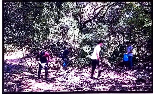
Plastic Waste Collection near to Pant Sachiv Wada