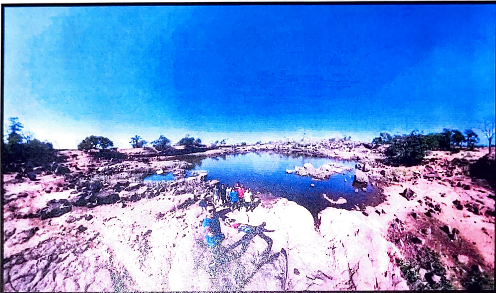
Some more Glimpse of activity