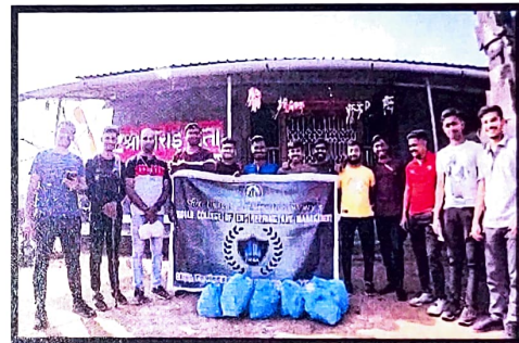
Plastic Waste Collection near to Borai Devi Temple