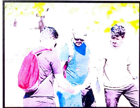
Some more Glimpse of activity