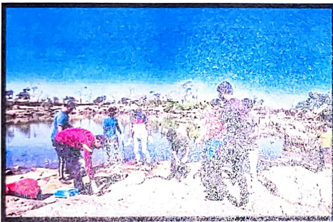
Plastic Waste Collection near to Shiv Mandir